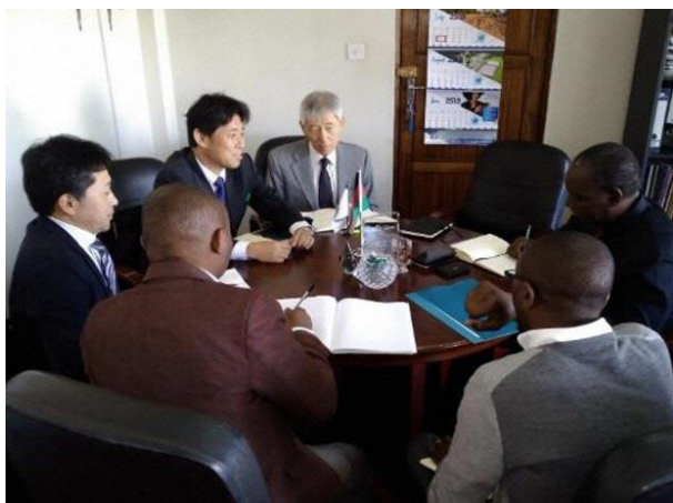
Conferring with government of Malawi