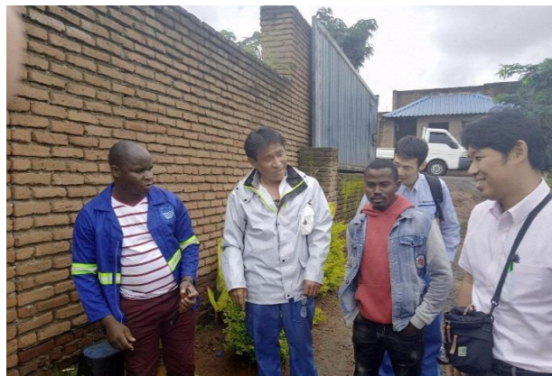
Water pressure survey in the model area