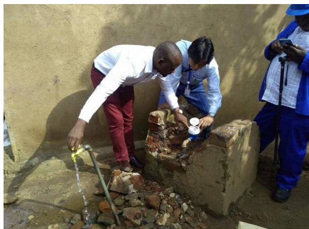
Instruction of setting water meter