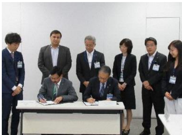
Ceremony for conclusion of MoU