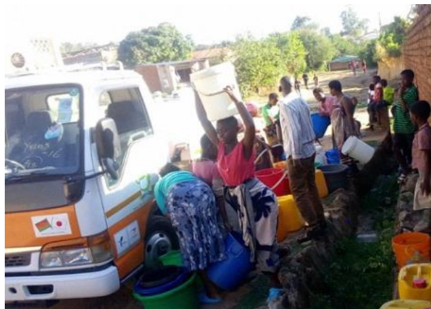
Utilization of water tank truck in Blantyre