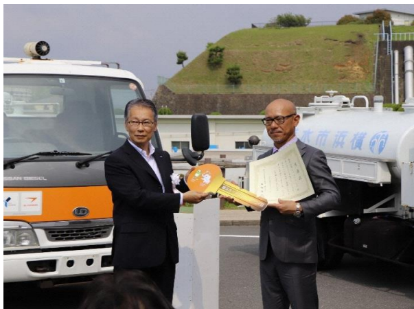
Ceremony of water tank truck donation