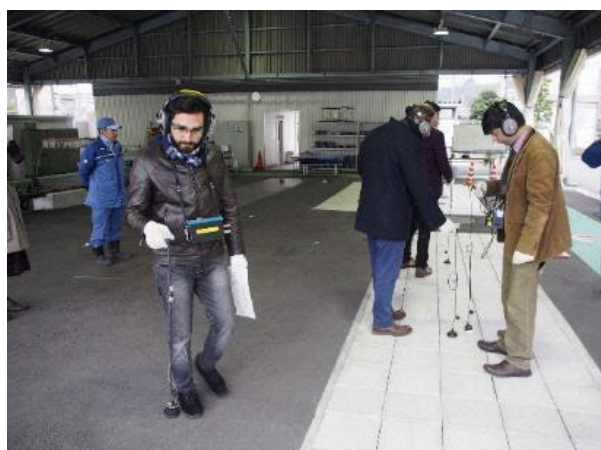
Training of leakage water investigation at YWWB