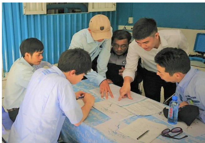
Discussion on water distribution management