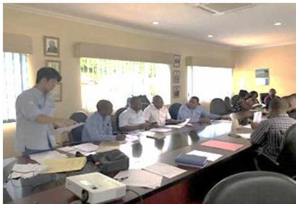
Workshop for the billing management