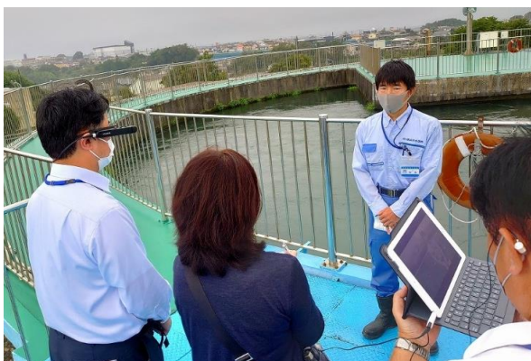
Broadcast of online water purification plant tour