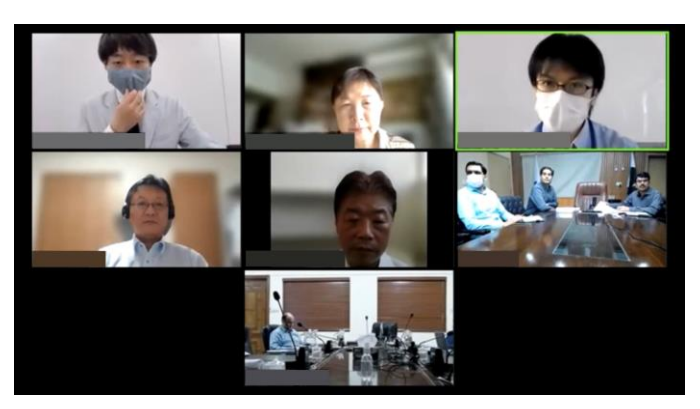
Online seminar participants (JFY2021)